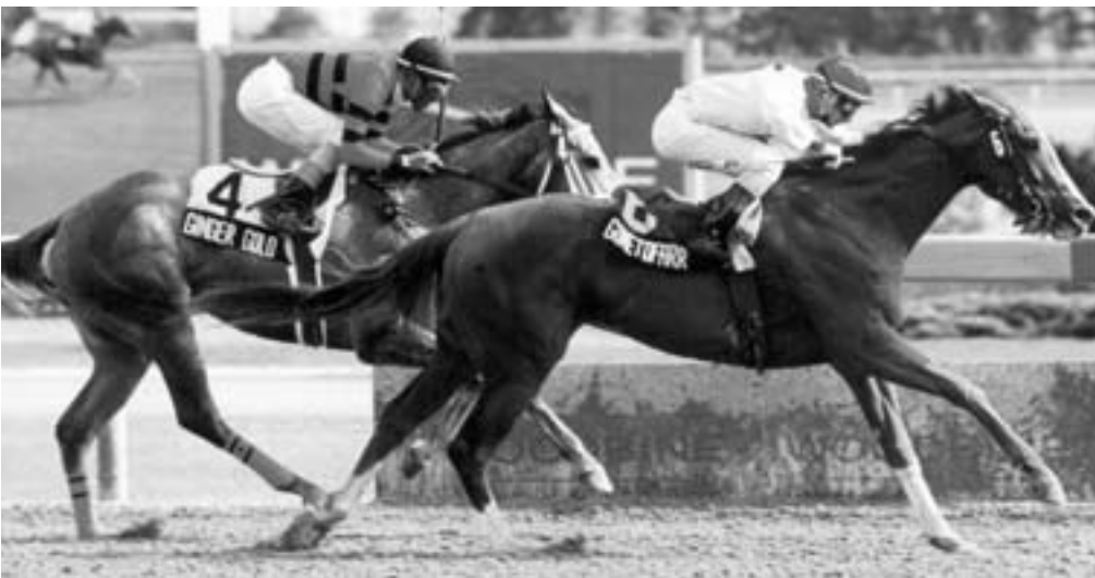
Gonetofarr wins the $150,00.00 Fury Stakes at Woodbine